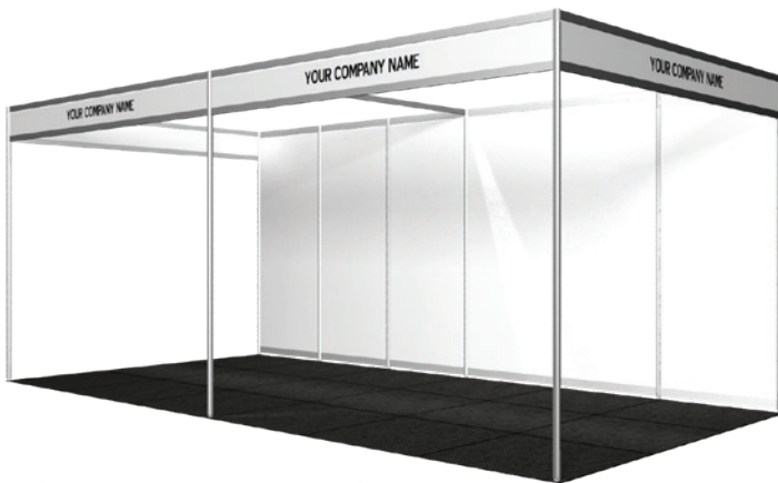
(Indicative booth image)