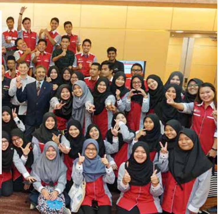
The Participants of 'Youth Forum'

UNIGIS was invited to contribute to the GeoSmart Asia 2015 (GSA) conference held in Kuala Lumpur, Malaysia from September 29th to October 1st, 2015 and to co-organise the 'Youth Forum' bringing academia, industry, organisations and students onto a common platform for promoting career-oriented one-on-one interaction. GSA is one of the largest regional conferences focussed on geospatial themes in S/E Asia and is being organised in different countries across the region. UNIGIS has been entrusted with a prominent role of conducting Geospatial Capacity Building sessions at the event since 2005 and this was the 11th such continuous session coordinated by UNIGIS at this international event.